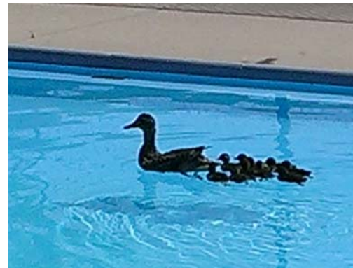
Ducks and Frogs have been among those enjoying the Summerlakes pool this year!